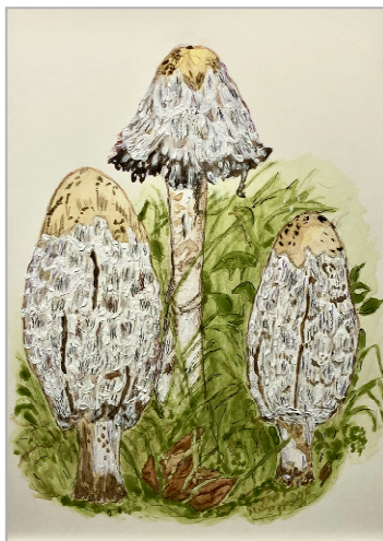
Drawing by Irene