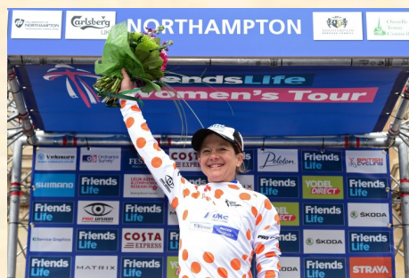
Cycling Champion Sharon Laws

Our popular cycling event, The Sharon Laws Sportive, held in memory of former pupil and cycling champion Sharon Laws, goes virtual this July. If you enjoy cycling, please set yourself a challenge and join our Strava club to add your cycling miles. There is no fee to register, but if you would like to contribute, please visit our website to donate to The Cotswold School. A beneficiary of the money we collect will be local charity Kate's Home Nursing, who cared for Sharon at the end of her life. Find out more on our website.