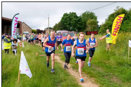
The team from Bourton Roadrunners heading off from the socially distanced start

After a year off because of Covid-19 the Greystones 10K and children's fun run, sponsored by Brio Retirement Living, returned on 4 th July. Over 50 runners tested themselves on the 10K course across the beautiful countryside of the Greystones Farm Nature Reserve.