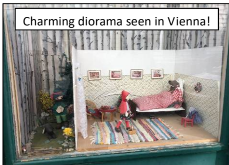
Charming diorama seen in Vienna!